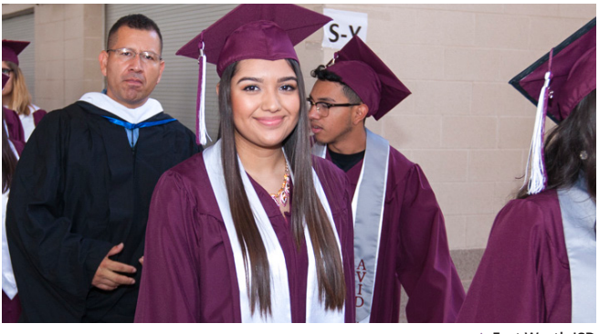
Fort Worth ISD

Preparing students for life beyond high school is vital for their economic future and the growth of the state, as most jobs require some education and training beyond high school. HB 8 (88R) created an incentive for colleges to partner with school systems to help students earn 15 hours of college credit in high school. The Legislature also provides incentives to transform certain traditional high schools into specially-designed college and career readiness schools to maximize the postsecondary success of students.